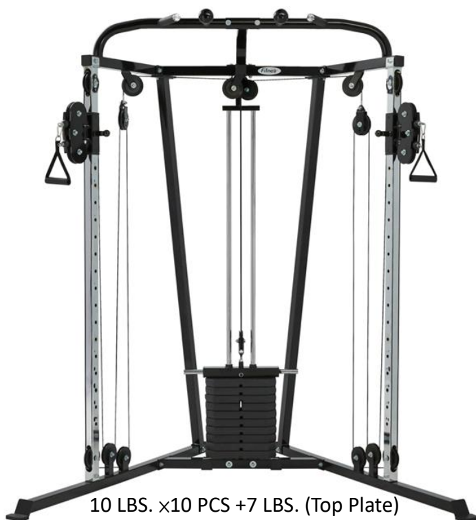
10 LBS. ×10 PCS +7 LBS. (Top Plate)