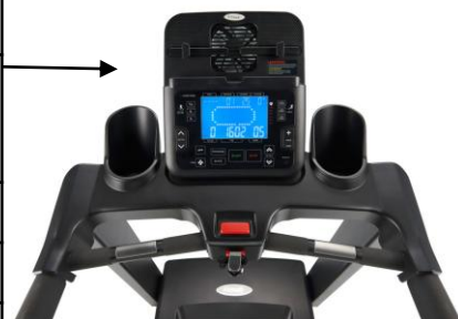
7.5" LCD display with LED backlight