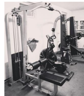
PLM-83 & PLM180X