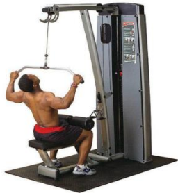
Pro dual DLAT-SF