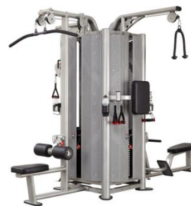
Jungle gym JG 4000S