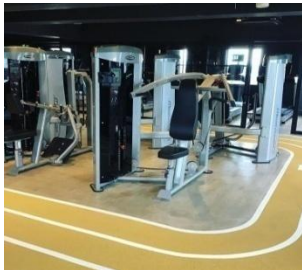
Pro club SLM-300