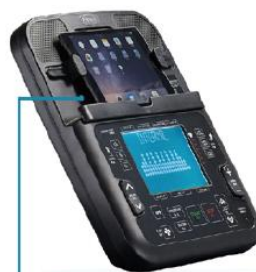
Adjustable book/Magazine stand (rack)