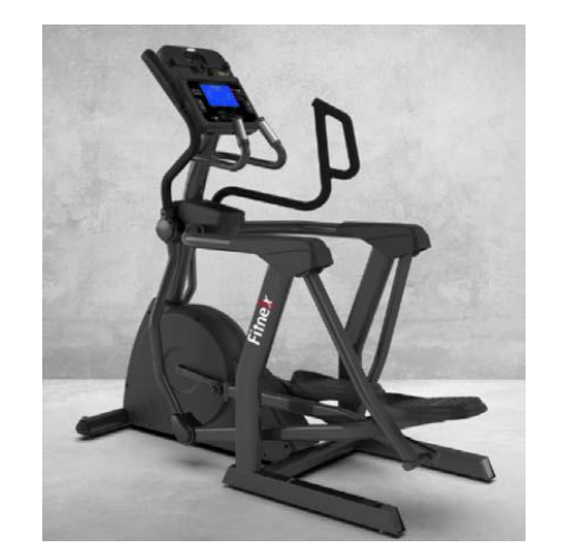
It's our job to be helpful, Staying healthy, keeping FIT